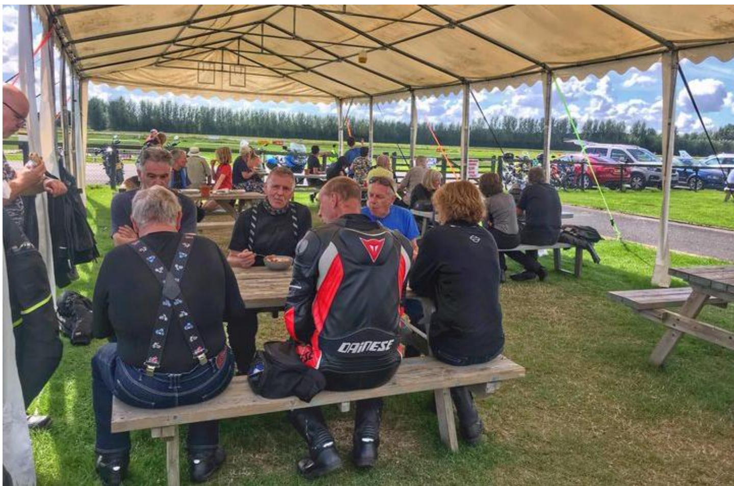
(Refuelling at Shobdon for the ride home)