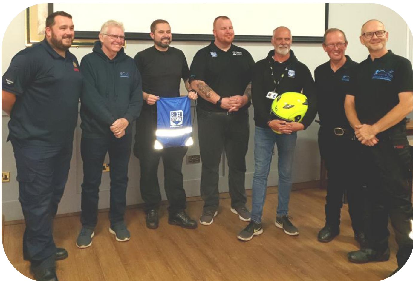
This photo shows the Biker Down team with sundry CWAMs.

https://www.warwickshire.gov.uk/bikerdown .