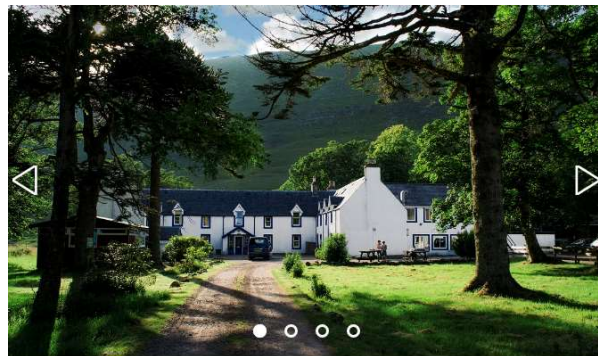
Applecross, Hartfield House