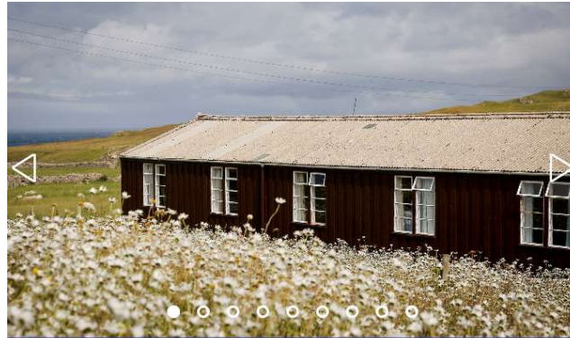
Durness Smoo Youth Hostel